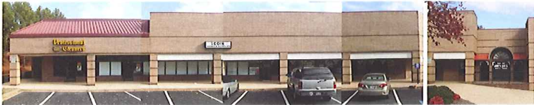
EXISTING ELEVATION - BUILDING 100