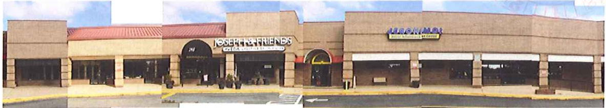
EXISTING ELEVATION - BUILDING 200