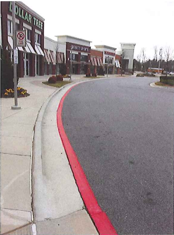
Precendent – East Village