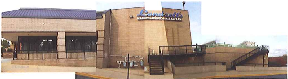
EXISTING SIDE ELEVATION - BUILDING 800