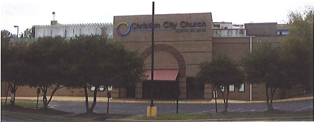
EXISTING LOWER LEVEL ELEVATION - BUILDING 800