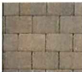
ENLARGED IMAGE OF PAVERS