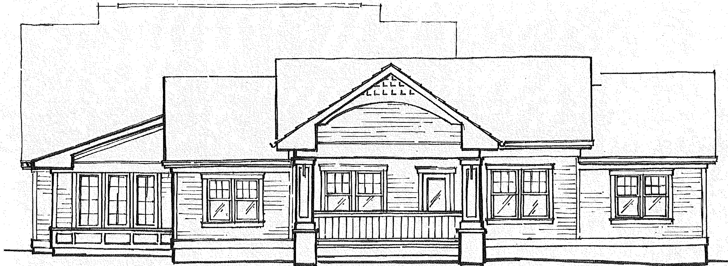
SCHEMATIC SOUTH-WEST ELEVATION