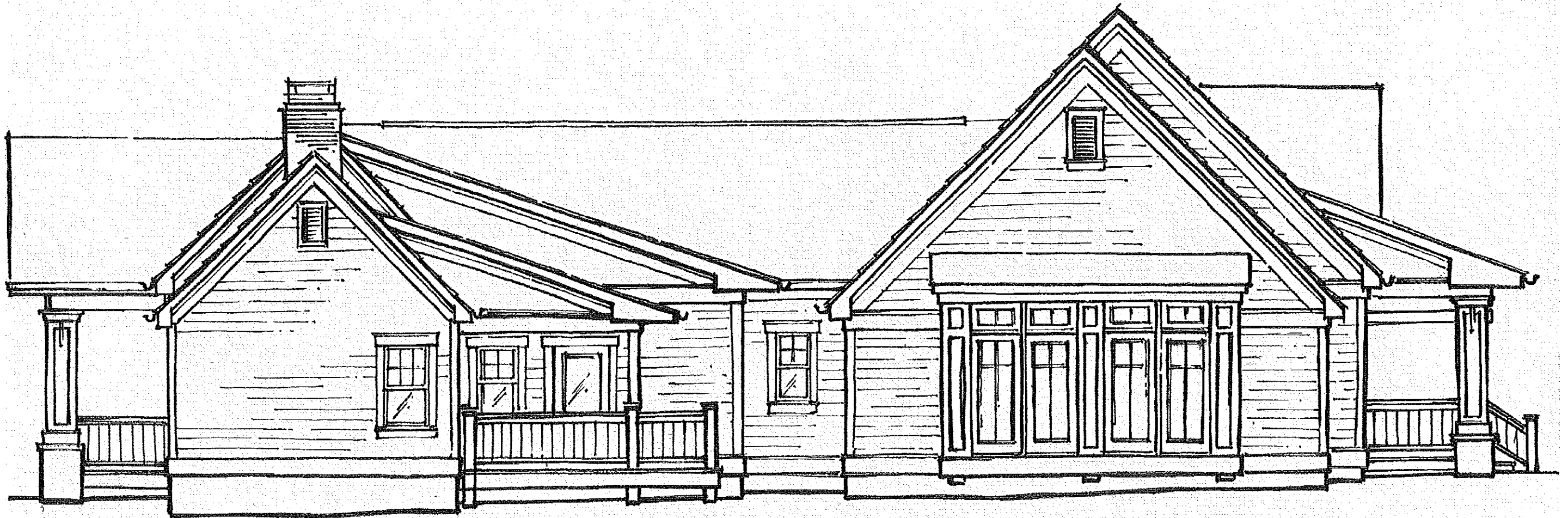
SCHEMATIC SOUTH-EAST ELEVATION