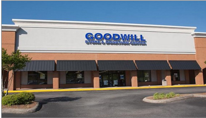
HOLCOMB BRIDGE STORE