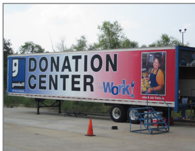
ROSWELL RECYCLING DONATION CTR. Open since 1996