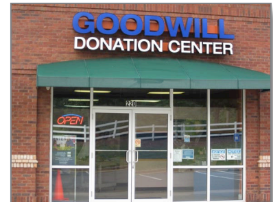
ROSWELL CORNERS DONATION CTR. Open since 2007