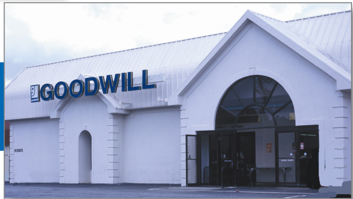
ROSWELL STORE Open since June 1996