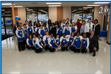
Holcomb Bridge Store Team