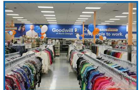
Inside the Holcomb Bridge Store