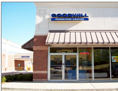
EAST ROSWELL DONATION CTR. Open since 2009