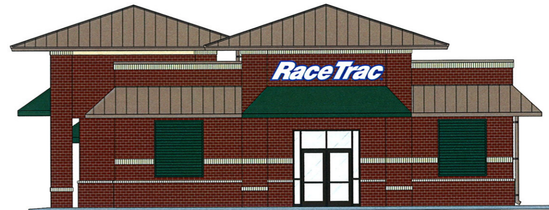
3 RIGHT SIDE ELEVATION A-2 SCALE: 3/16" = 1'-0"