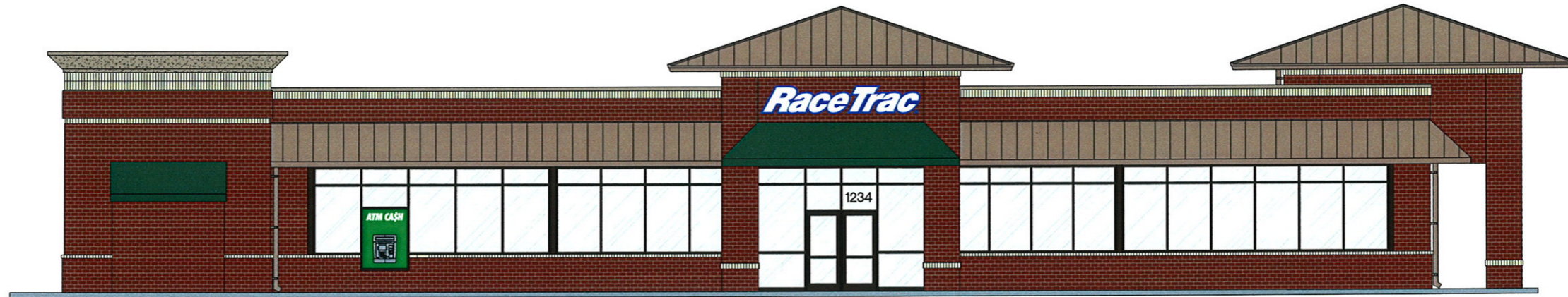
1 FRONT ELEVATION A-2 SCALE: 3/16" = 1'-0"