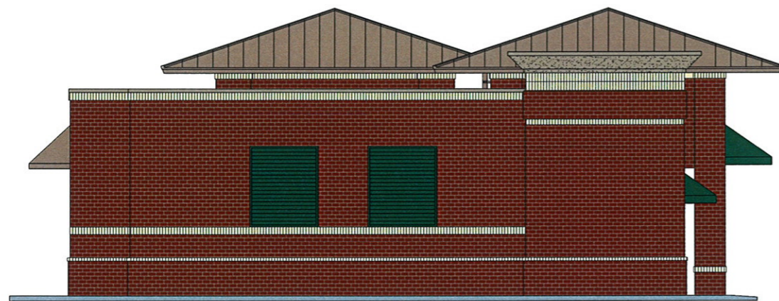
2 LEFT SIDE ELEVATION A-2 SCALE: 3/16" = 1'-0"