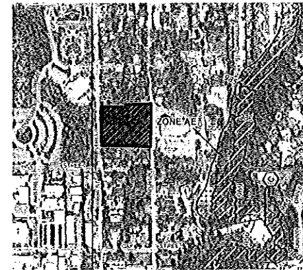
FIRM MAP 1"=500' PANEL (F.I.R.M.) NO. 13121C 00A/F REVISED: JUNE 18, 2010