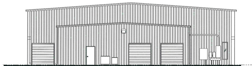
EXISTING REAR ELEVATION SCALE: 1/8" = 1'-0"